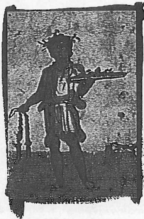
Detail of Pompeian household shrine fresco.

10 The giant pine is more often troubled by the wind, and the tallest towers collapse with a heavier fall, and bolts of lightning strike the tops of the mountains.